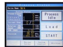
● Control panel