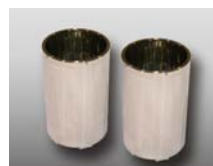
● Accessory: 10L SUS Containers